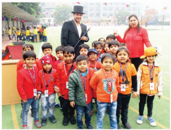
A magical experience!