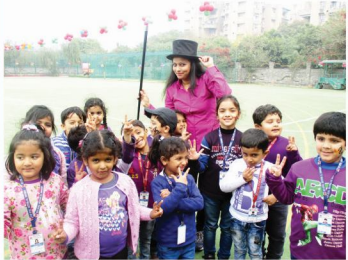
Casting a spell