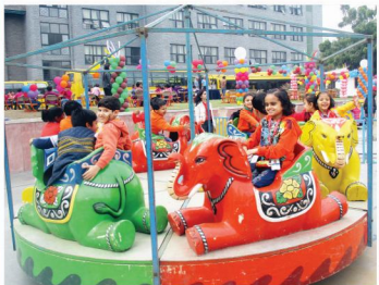
A joyous ride